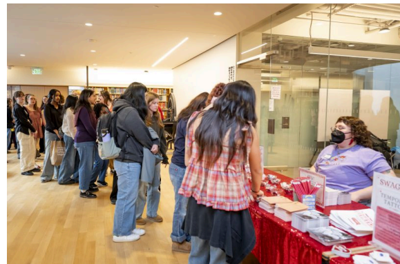
Special Connections in Special Collections.

On February 13, Special Collections hosted the very popular Special Connections in Special Collections event. In addition to displays of sweet and spicy items from the collections, there was fun swag, romantic decorations, and a WOZQ DJ spinning tunes. This year, 678 students and community members attended the afternoon event.