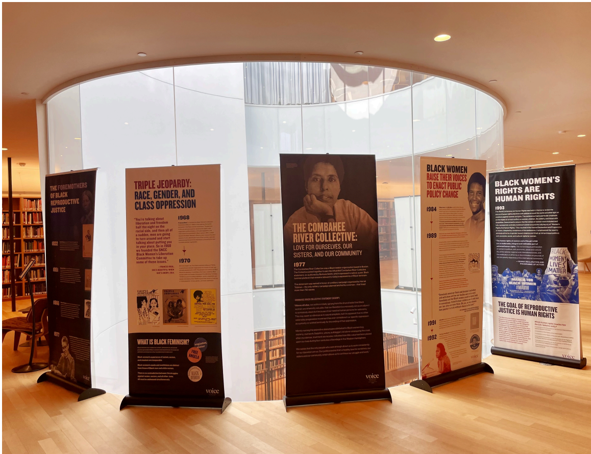
Black Reproductive Justice HERStory Walk exhibit.

Throughout the month of March, in partnership with the Human Rights Initiatives at Smith and several campus departments, the traveling exhibition, Black Reproductive Justice HERStory Walk , will be on display on Neilson Library's 3rd floor. This showcases the history, stories and continuing impact of the Black reproductive justice movement, including that of Smith professor Loretta Ross.