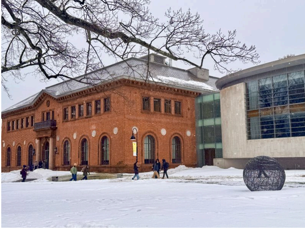
Neilson Library during a recent snow flurry.